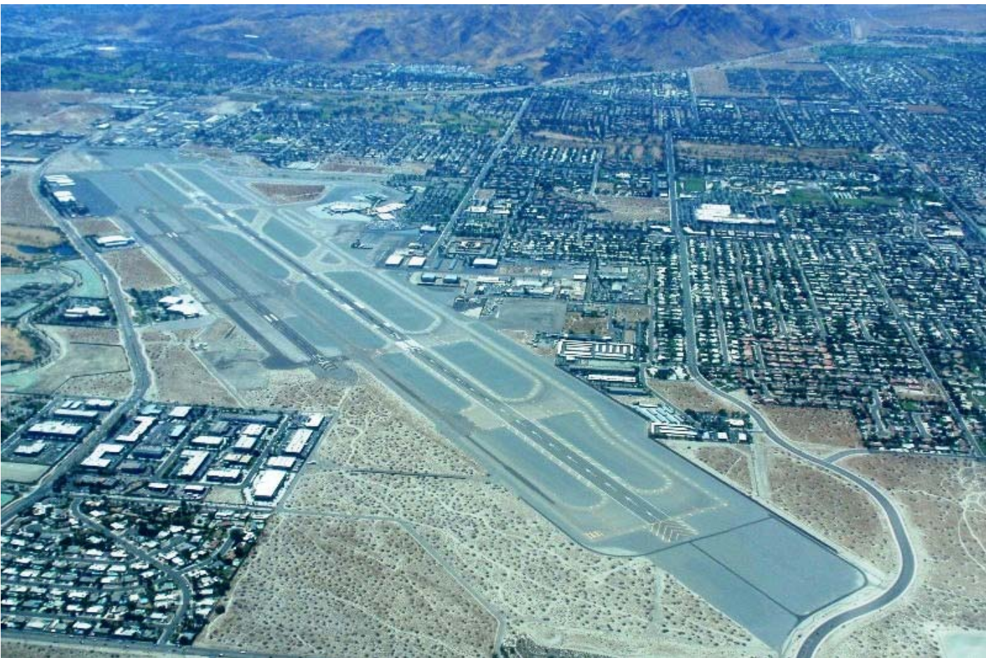
As we flew by Palm Springs' airport, I got to fly for 20 seconds while Charles snapped a shot for you.