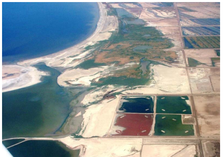
I took these two pictures just for the interesting colors that showed up outside my window