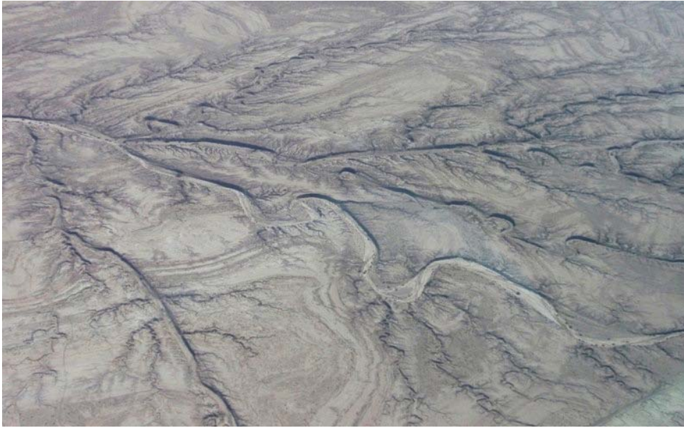
We went by some pretty desolate terrain sculpted by winds, water, and time