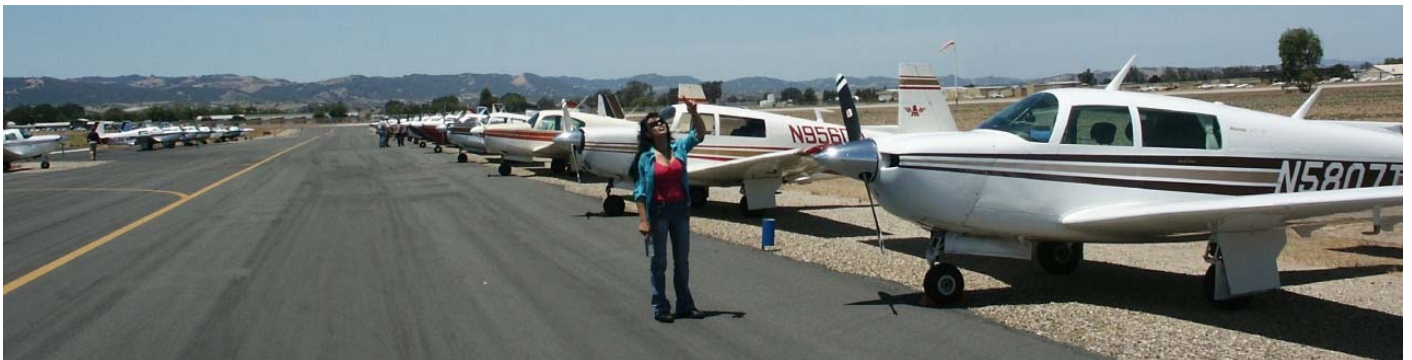
Watching the aerobatic competition being held over the east end of the airport