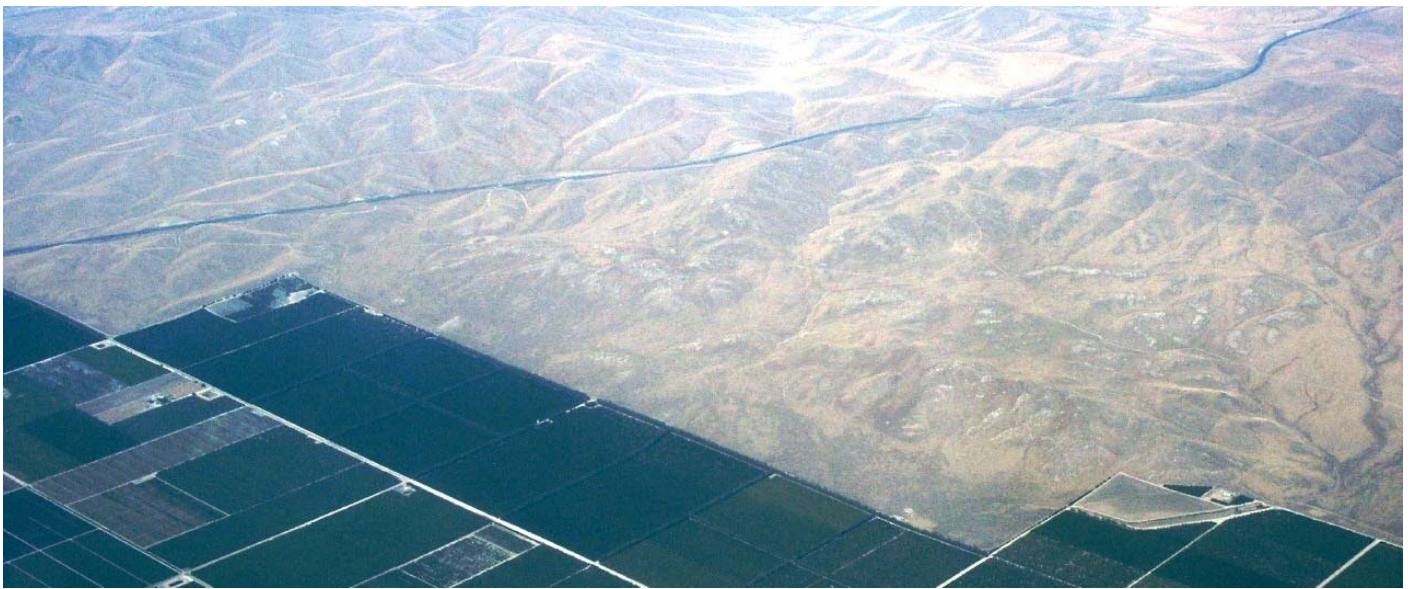
Highway 58 from Bakersfield to Tehachapi leaving farm country and heading southeast through the foothills.