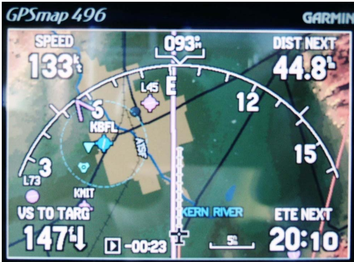
GPS Moving Map display 44.8 nautical miles from Tehachapi

About 40 miles out, the red Left Fuel Low annunciator sign came on. OK, that works. I switched to the right tank which had over an hour's worth in it. On this particular flight direction, we had to clear some pretty high hills just before descending into the valley area where the Tehachapi airport is located. With the airport in sight five miles away, and 4 or 5 thousand feet to descend, I got to have some fun. I announced my position on 123.0, turned the autopilot off, reduced power, popped up the red speed brakes, rolled over into a 45-degree bank, pointed the nose at the dirt, and dropped like a rock. 1700 fpm baby. I would never do this with most of the people that go with me. It would scare them. Sofie was having fun. She told me later that it was the high point of that leg of flight.