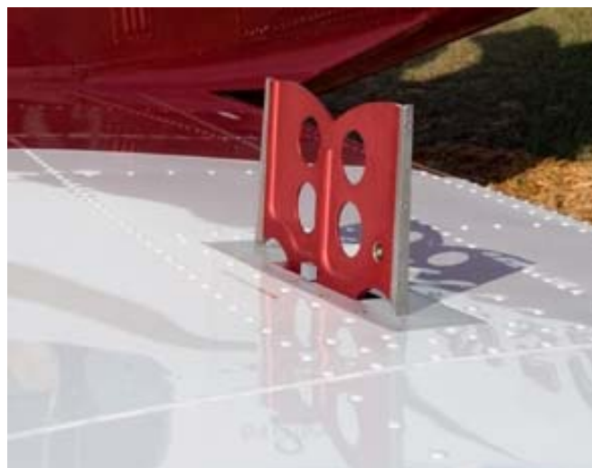
Precise Flight's Speed brakes deployed

About 40 miles out, the red Left Fuel Low annunciator sign came on. OK, that works. I switched to the right tank which had over an hour's worth in it. On this particular flight direction, we had to clear some pretty high hills just before descending into the valley area where the Tehachapi airport is located. With the airport in sight five miles away, and 4 or 5 thousand feet to descend, I got to have some fun. I announced my position on 123.0, turned the autopilot off, reduced power, popped up the red speed brakes, rolled over into a 45-degree bank, pointed the nose at the dirt, and dropped like a rock. 1700 fpm baby. I would never do this with most of the people that go with me. It would scare them. Sofie was having fun. She told me later that it was the high point of that leg of flight.