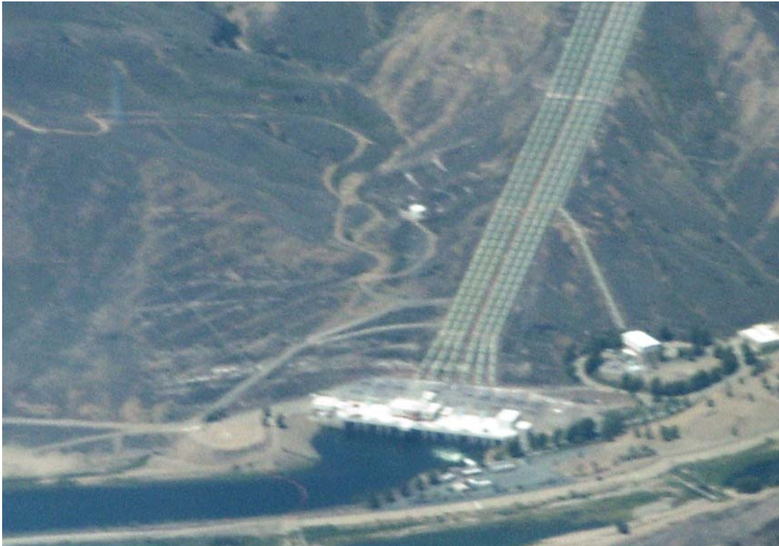
Large water pumping operation in the mountains