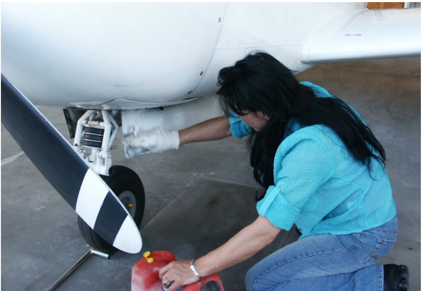
Looking much better than before

Looking at the nose gear doors, I saw areas that could use some cleaning. Now, people, I am not lazy. But to kneel down to work on something that low to the ground raises havoc with my pain threshold due to the arthritis in my knees. I gave her a rubber glove and some solvent, and she attacked the dirty areas. This hangar wench idea was getting to be really comfortable by now. Every hangar could probably use one.