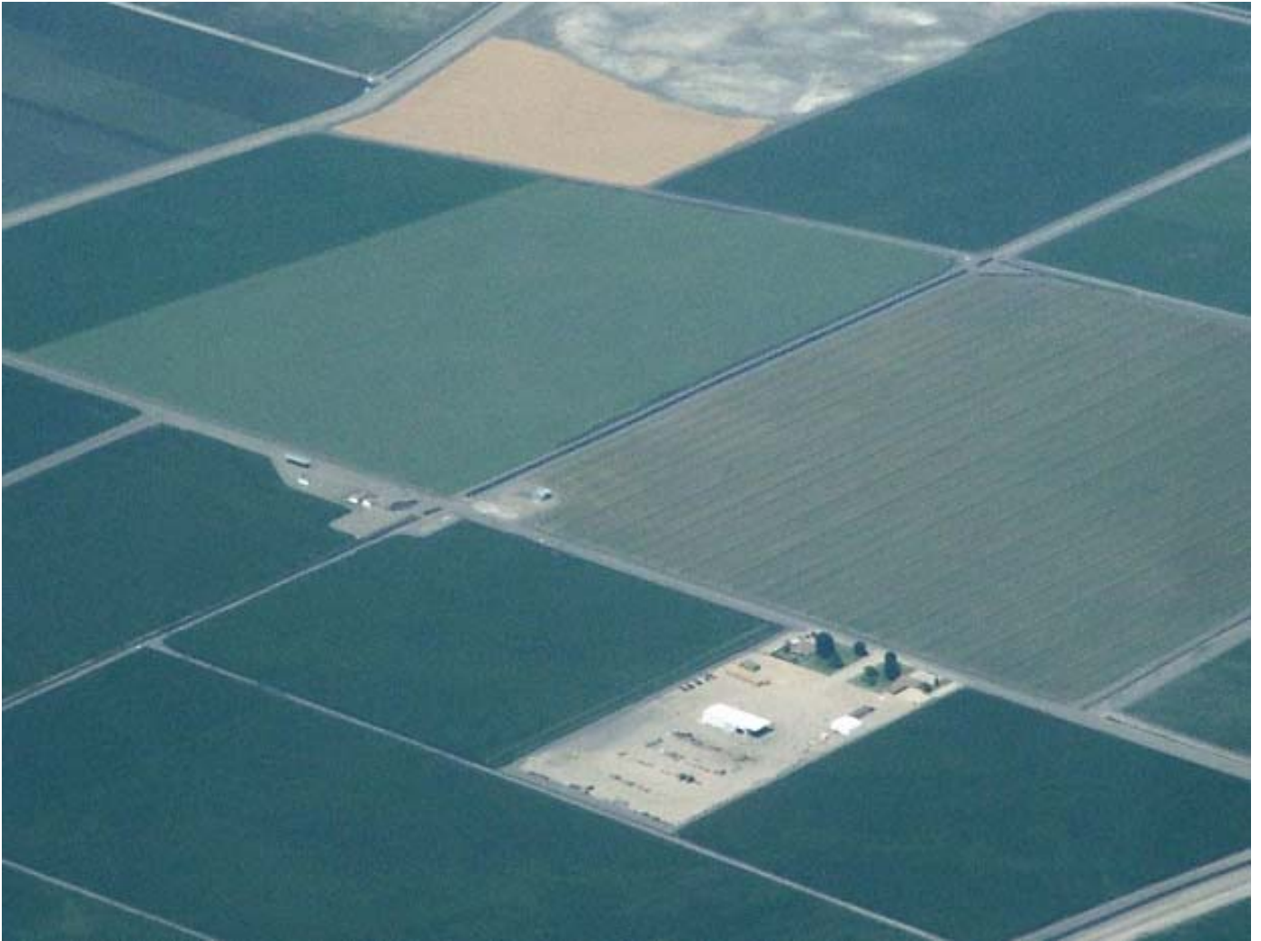
Canals and crops growing in California's vast San Joaquin Valley