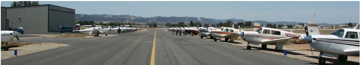
Mooneys, Mooneys everywhere.