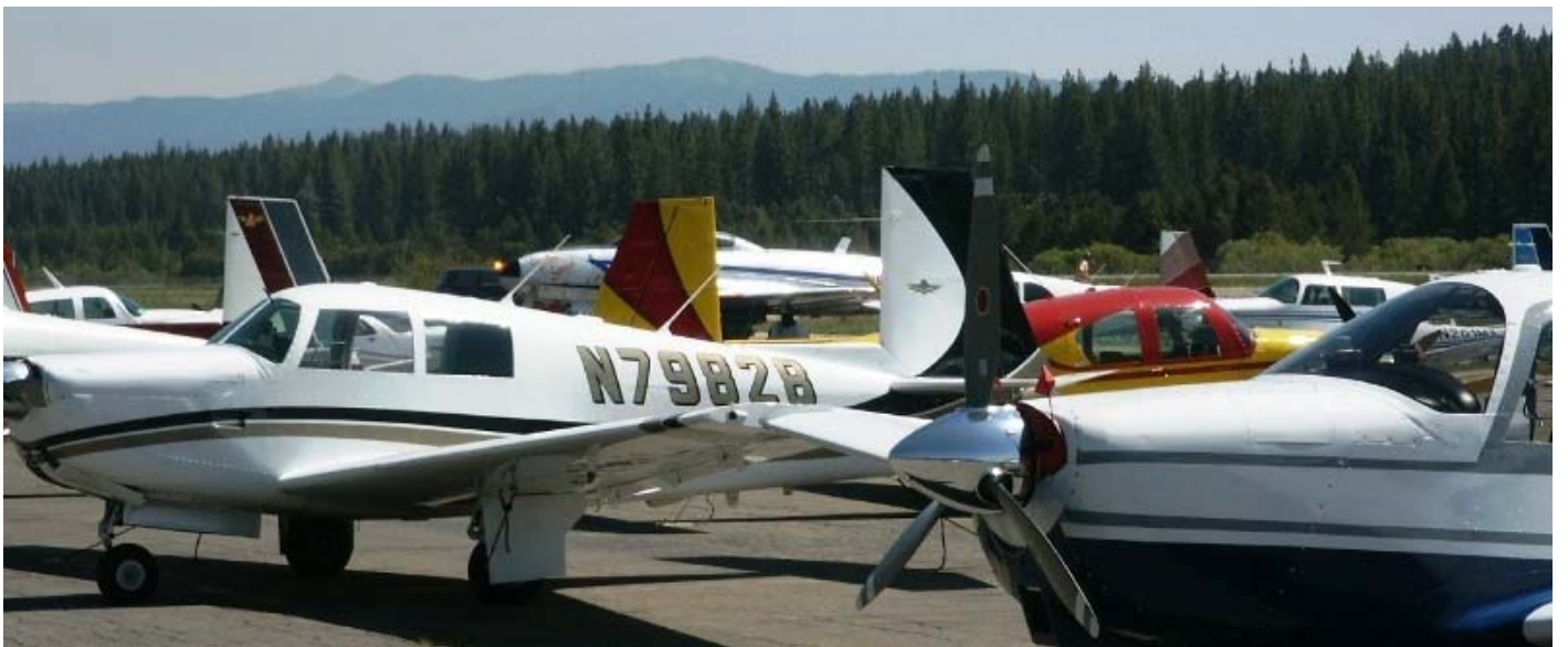
Mooney spinners and tails everywhere!!!