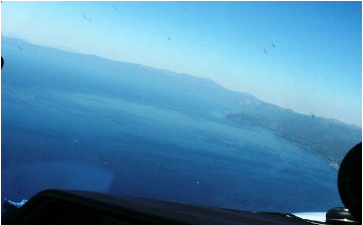
Out the front window in a left turn over Lake Tahoe while reducing altitude for landing