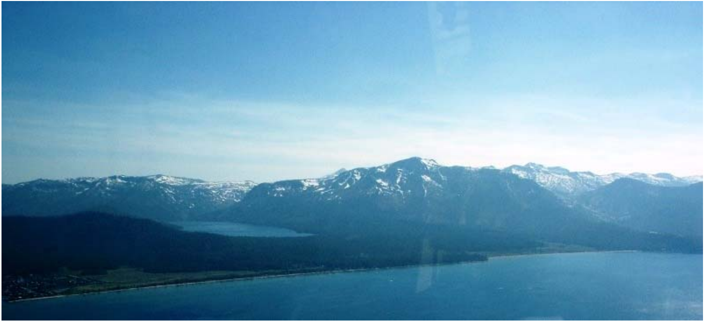
A serene scene

Fast forward for a while and we landed at Lake Tahoe (TVL). We all welcomed each other, as always. This was the day before the fly-in and we still had around 20 Mooneys snuggled together in sweet harmony. A bunch of us met for dinner at a nice Italian restaurant about 3 miles down the road. Here is where we can talk "flying" and "Mooney" for hours, and never get tired of it.