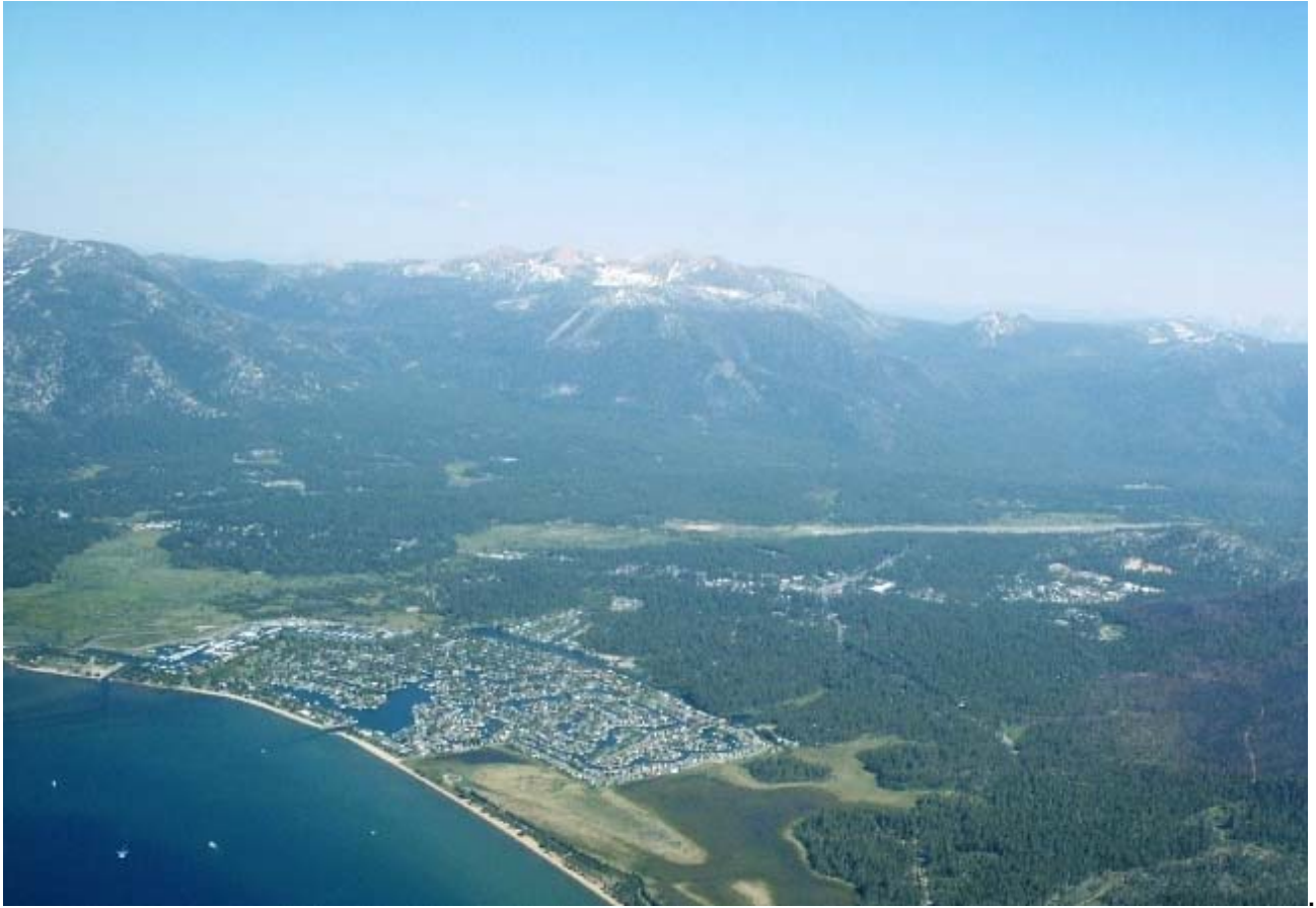
The City of South Lake Tahoe and the airport in the distance