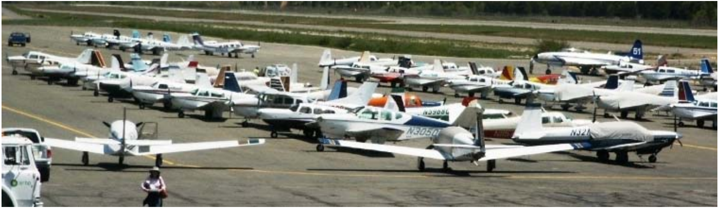
Same view zoomed in