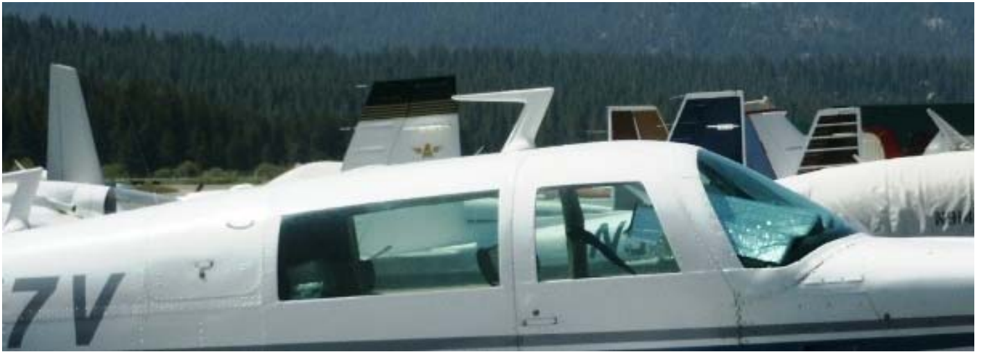
Lots of Mooney tails