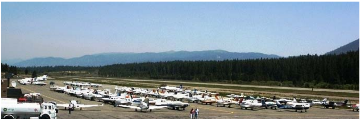
All of us - over $5,000,000 worth of Mooneys