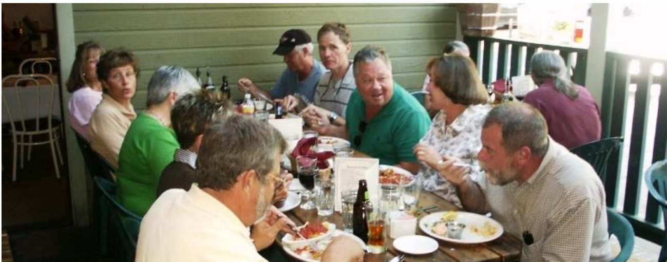
Some of the group found a nice table out on the patio