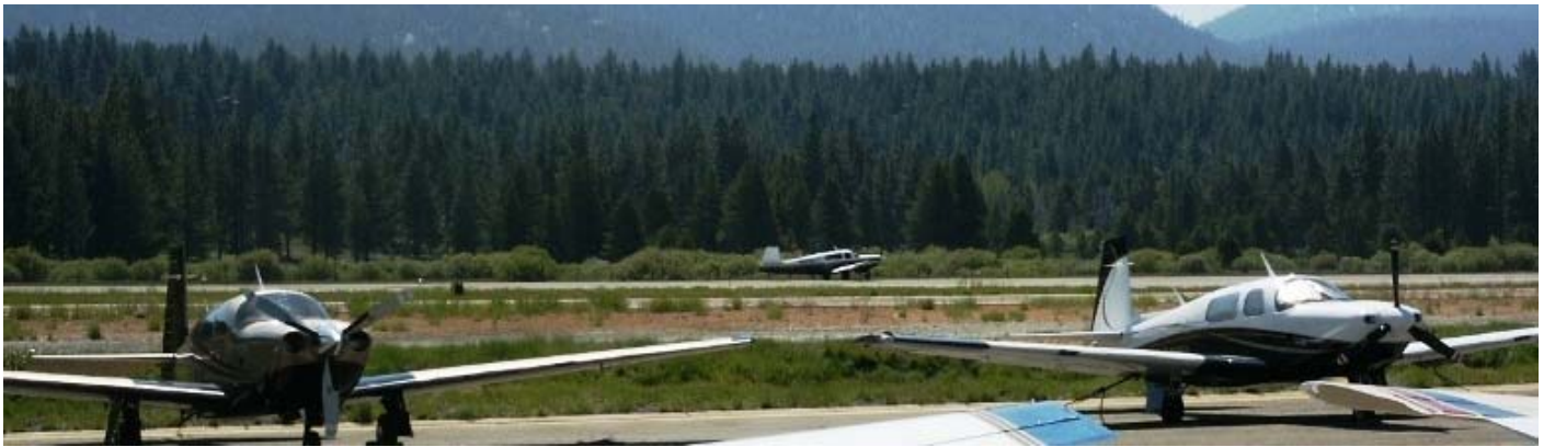
Another Mooney landing in the distance ☺