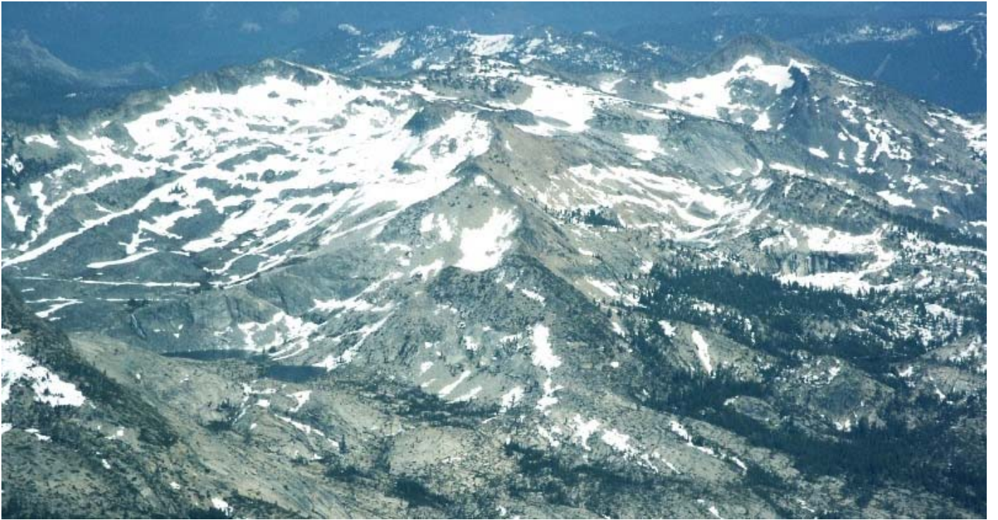
Majestic and awesome